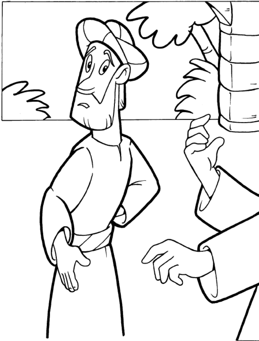
The Rich Young Ruler